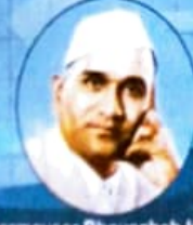
Karmaveer Bhausaheb Hiray