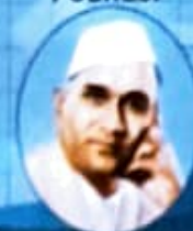
Karmaveer Bhausaheb Hiray